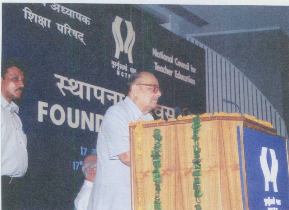
Hon'ble Minister of Human Resource Development addressing the participants on the occasion of NCTE Foundation Day