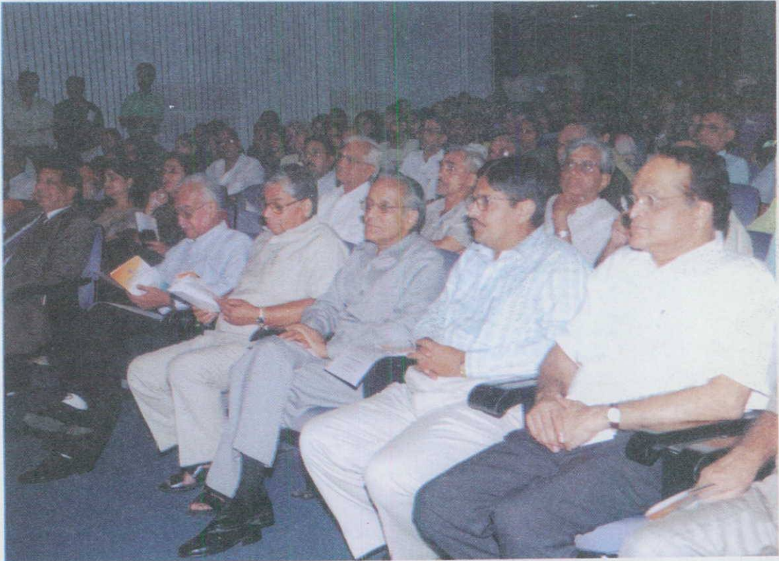
Subject Experts and Senior functionaries in Education Sector— Participating in deliberations in a NCTE function.

These recommendations are being taken up by the NCTE to formulate systems for conducting of research at NCTE as well as through other national and state bodies in the area of priorities formulated by the NCTE.