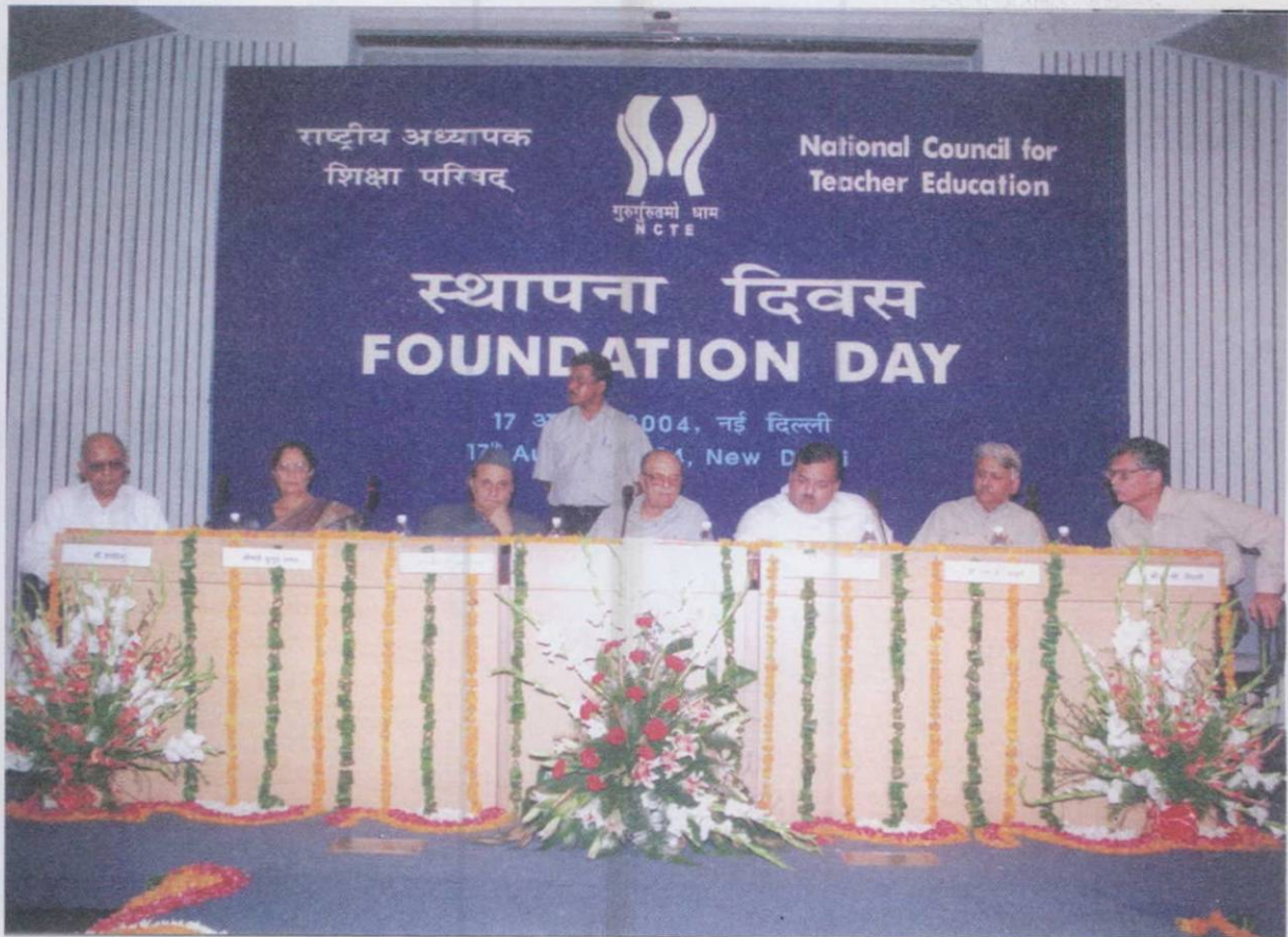
Hon'ble HRM and MOS (HRD) with Dr. Karan Singh and Senior Officers on NCTE Foundation Day.