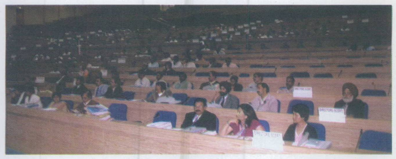
Educationists and Experts from different states participating in the National Conference of SCERTs Directors and Principals of DIETs